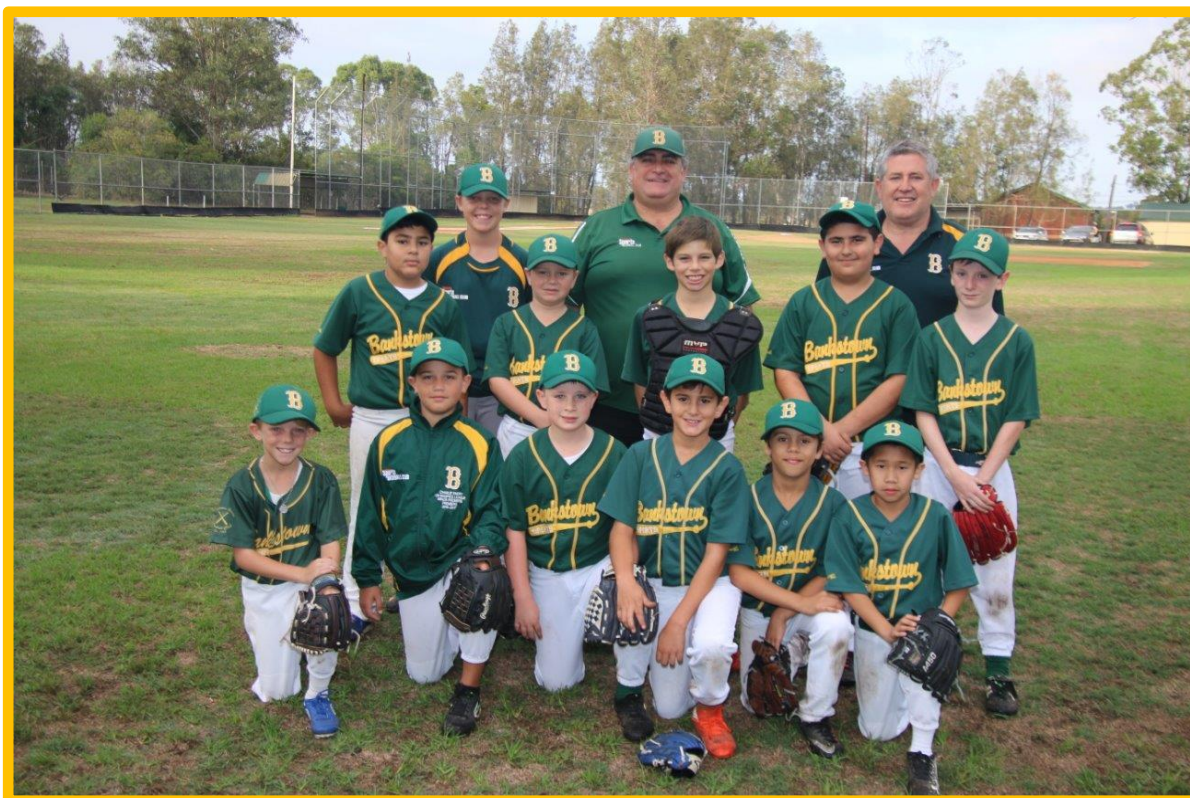
2017-18 Little League Minor Pitch