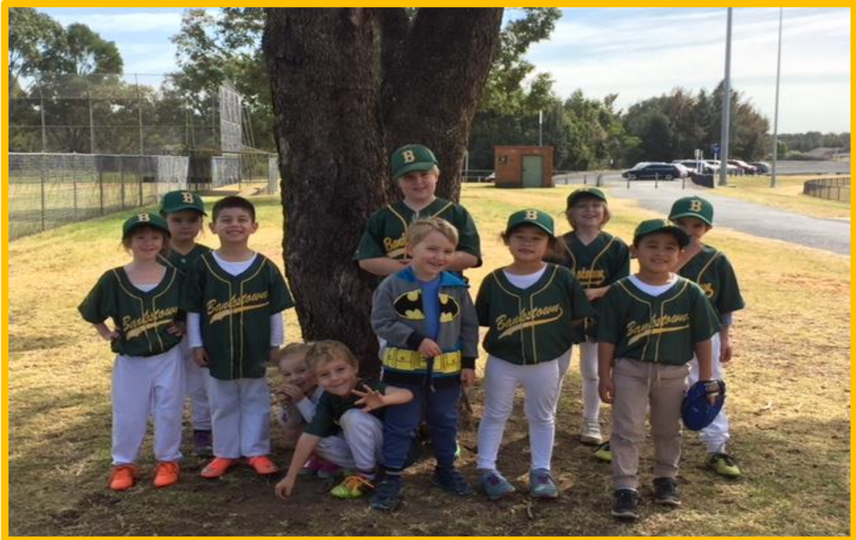
2017-18 T Ball Team