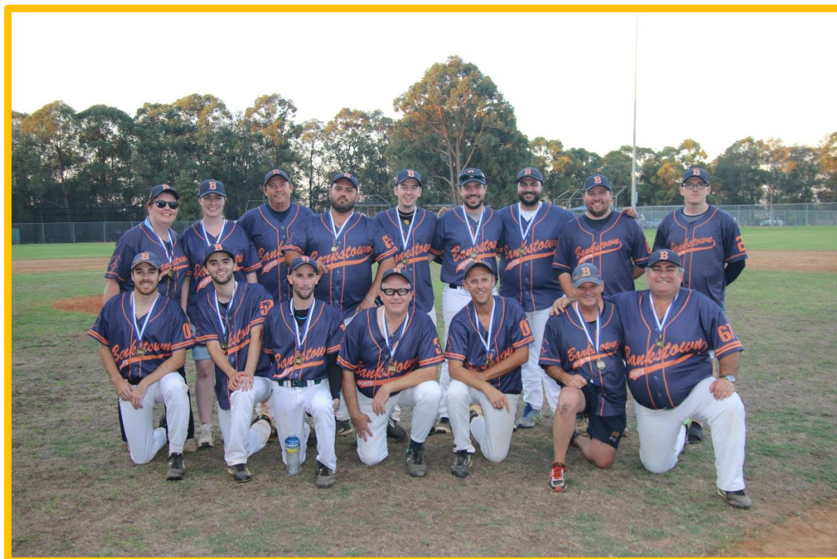
2017-18 Seniors Division 1B Champions

Well once again “WE ARE THE CHAMPIONS” 😊